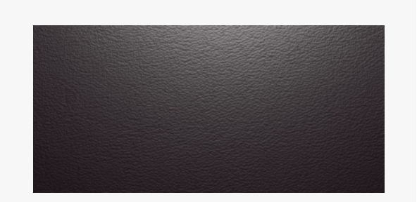
MAIN HIDE DAMSON