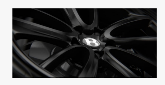
WHEELS MULLINER DRIVING SPECIFICATION AND BLACKLINE SPECIFICATION WITH 22"