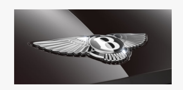
PAINTS BLACK VELVET