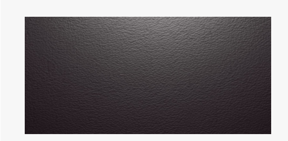
SECONDARY HIDE DAMSON